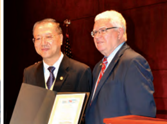
Awarded World Ambassador for Peace in the US Capitol Building (US Congress)