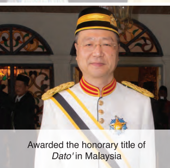
Awarded the honorary title of Dato' in Malaysia