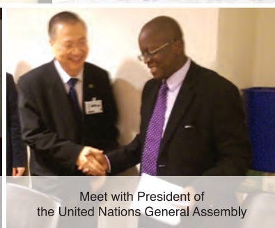
Meet with President of the United Nations General Assembly