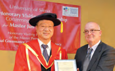
Honorary Visiting Professor at University of Siena, Italy