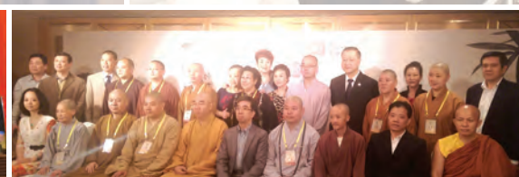
Attended "Interview with One Hundred Preeminent Monks" press conference in Hong Kong