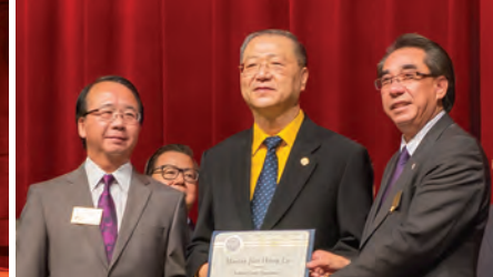
Awarded certificates of recognition from six city councils in California, USA