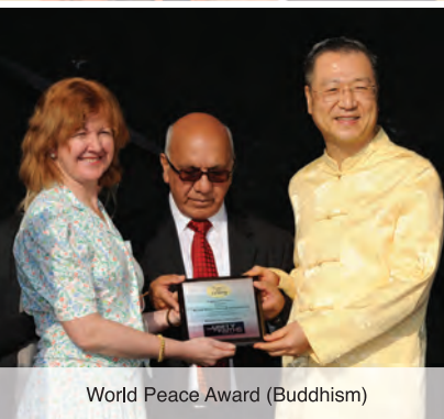
World Peace Award (Buddhism)