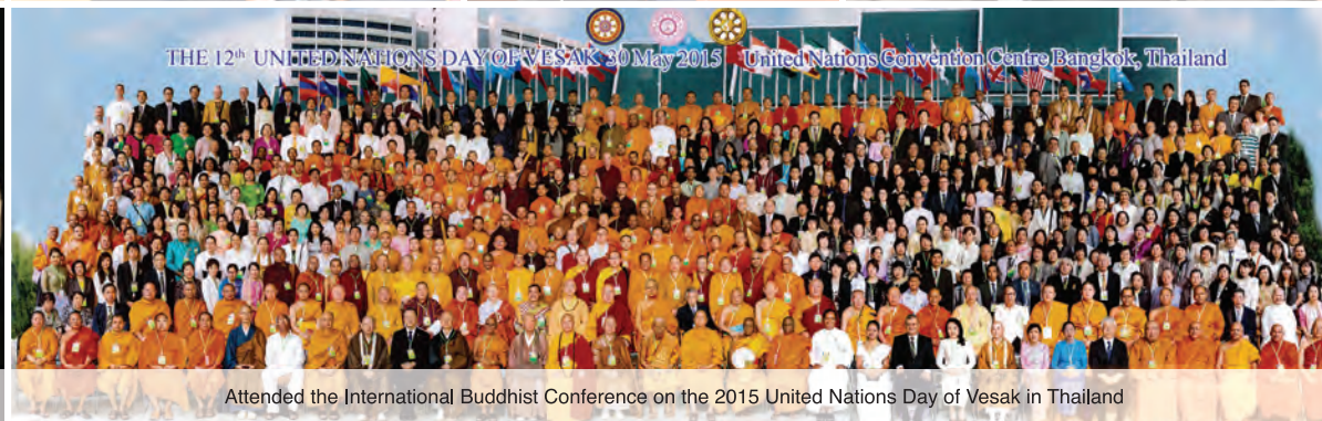
Attended the International Buddhist Conference on the 2015 United Nations Day of Vesak in Thailand