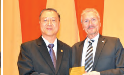
Awarded Ambassador of Peace Education at UN headquarters