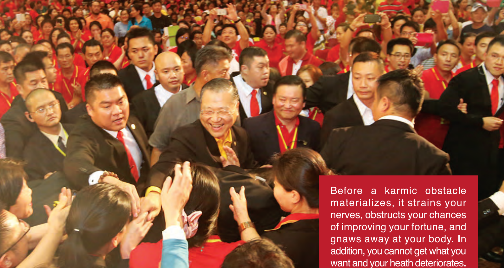
Master Lu's public talk in Sabah, Malaysia, January 2015.

Before a karmic obstacle materializes, it strains your nerves, obstructs your chances of improving your fortune, and gnaws away at your body. In addition, you cannot get what you want and your health deteriorates. These symptoms are interest payments on your karmic debt and a reminder of payback. Whenever a karmic obstacle materializes and the payback time approaches, your karmic creditor will start collecting the debt in various ways, such as through sudden illness or accidents. Once you pay off the debt, this karmic obstacle will be eliminated.