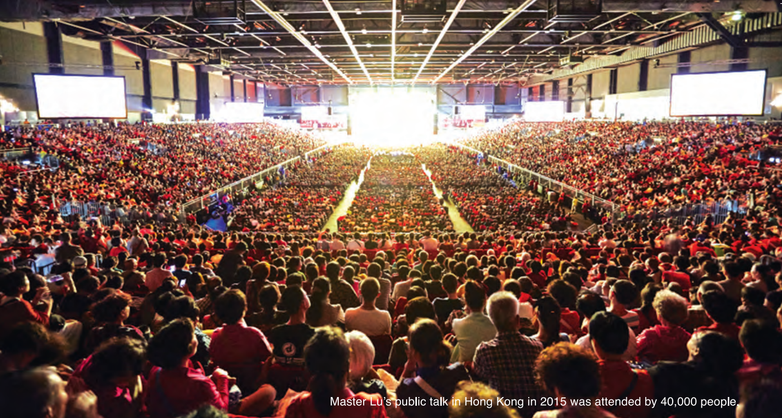
Master Lu's public talk in Hong Kong in 2015 was attended by 40,000 people.