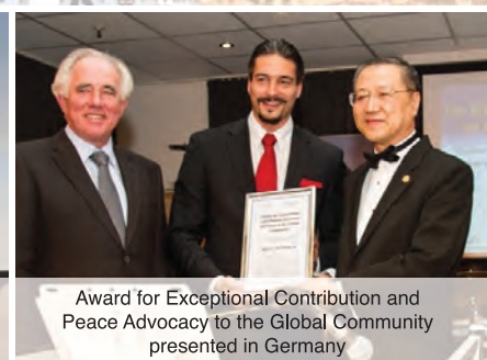
Award for Exceptional Contribution and Peace Advocacy to the Global Community presented in Germany