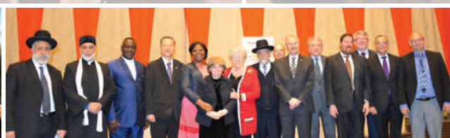
Attended summit meeting on the culture of peace at UN headquarters