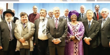
Attended Annual Conference of Cultural Diplomacy in Germany